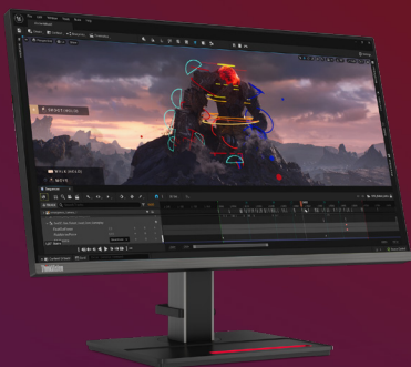
ThinkVision Creator Extreme 27" 4K UHD Monitor