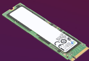
2TB Performance PCIe Gen4 NVMe OPAL2 M.2 2280 SSD